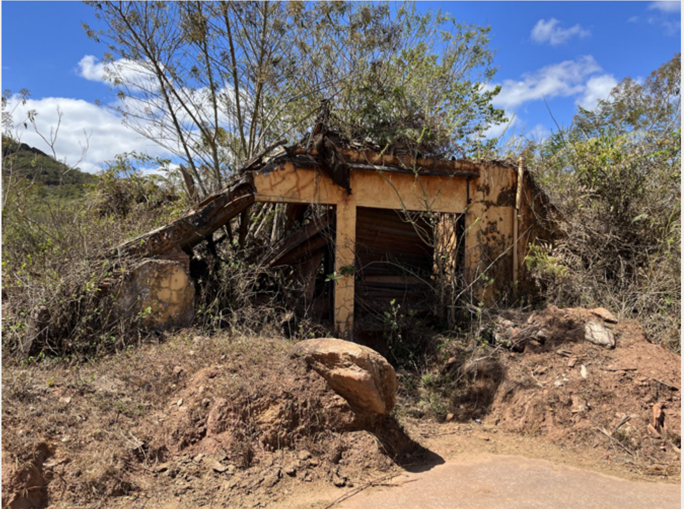
Structure destroyed by the Mariana tailings dam collapse, photo taken 27 August 2022

rights and environmental impacts in the three areas. In many of these situations, LAPFF has no external evidence to verify either the community or company views and has requested that independent assessments be conducted and disclosed so that LAPFF, and other investors, have a clearer factual basis on which to assess various allegations and defences.