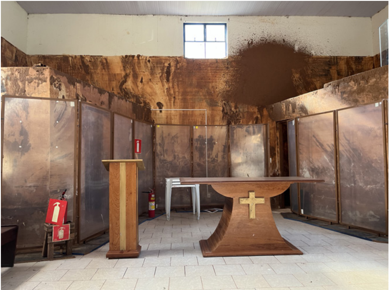
Mud line in church in Mariana, photo taken 25 August 2022

affected individuals needed – and are used to - open air kitchens to cook in their traditional manner. 33 In Brumadinho and Mariana, community members explained that the effect of the dam collapses on their water sources meant they could no longer use the water for the recreational purposes as they had used them previously. In Mariana, affected community members from Bento Rodrigues and Paracatu were extremely upset about the way in which the