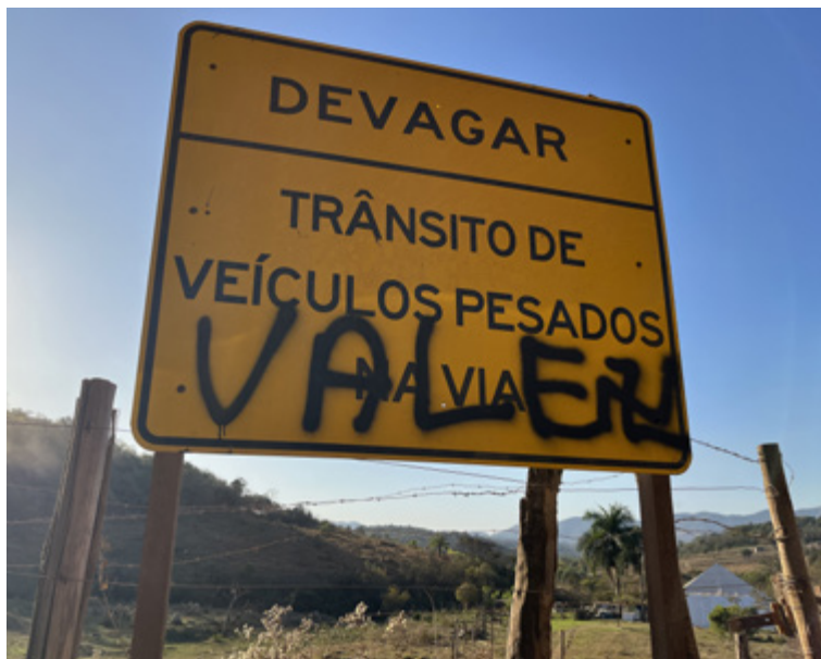
Sign showing strength of Brumadinho community's distrust of Vale, photo taken 18 August 2022