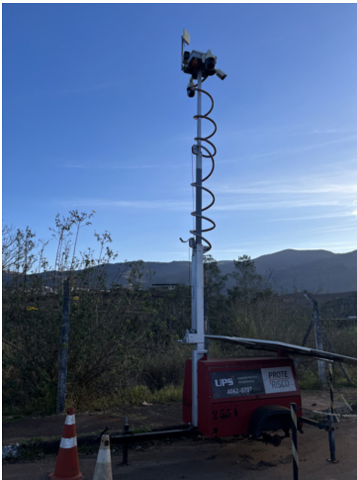
Affected community members in Mariana suggested that this was a Vale CCTV camera used to watch one of the communities, photo taken 24 August 2022