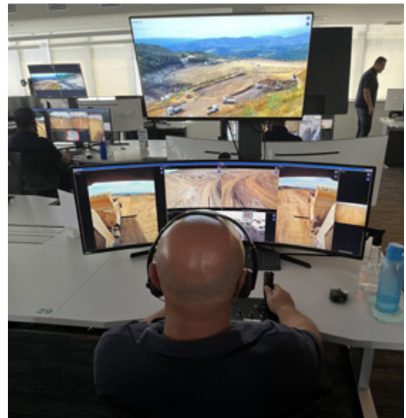
Vale control room at Belo Horizonte, photo taken 30 August 2022

Furthermore, Vale states that it has built backup dams downstream of the dams that have the capacity to contain the tailings if needed and that 100 percent of the population close to risk areas were removed on a preventive basis. LAPFF accepts that this is the case but remains concerned that communities have reported that the backup dams would trap them if