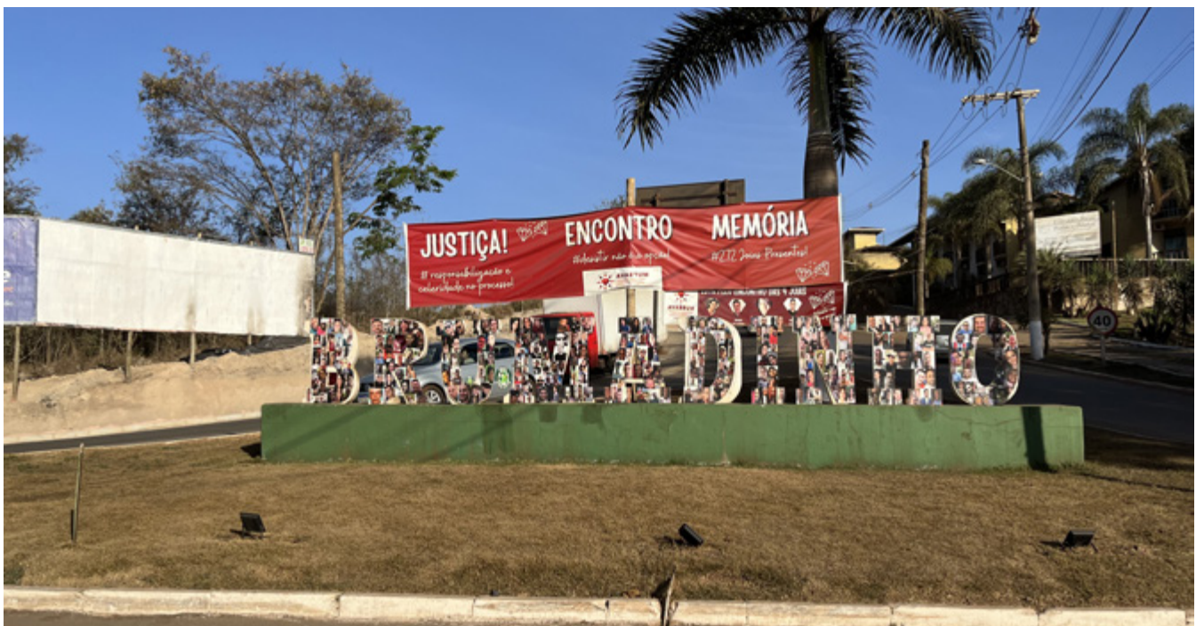
Sign at Brumadinho with the photos of all the people killed in the 2019 tailings dam collapse, photo taken 16 August 2022