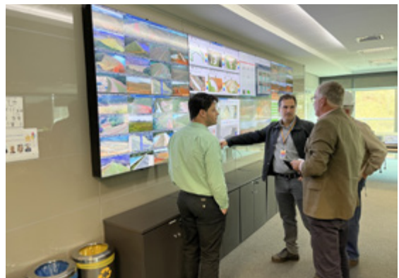
Vale's geomonitoring centre in Belo Horizonte, Minas Gerais, photo taken 30 August 2022

While these developments are positive, Vale has still acknowledged that the company has two high risk tailings dams in Brazil. Although the dams are being decharacterised, they could still rupture at any time. LAPFF heard from community representatives that at least one of these dams is three times the size of the Córrego do Feijão dam at Brumadinho and could cause significantly more damage than either