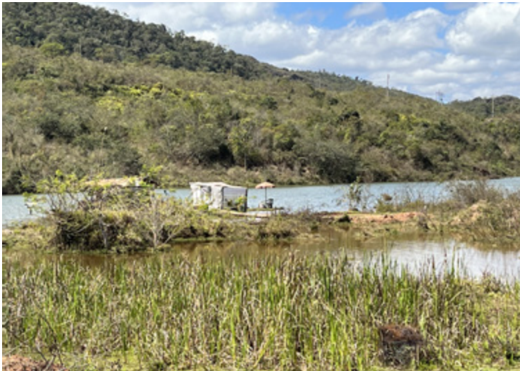
Water where Mariana houses reportedly used to be, photo taken 27 August 2022

to comply with IFC Performance Standards, with community participation in the design and layout of replacement housing and social amenities.’