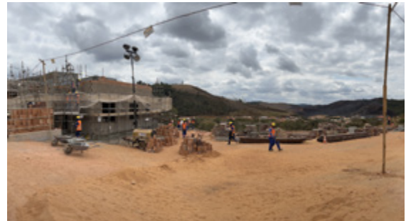
Paracatu resettlement with Vale and Renova, photo taken 29 August 2022 (nearly seven years after the Samarco tailings dam collapse)