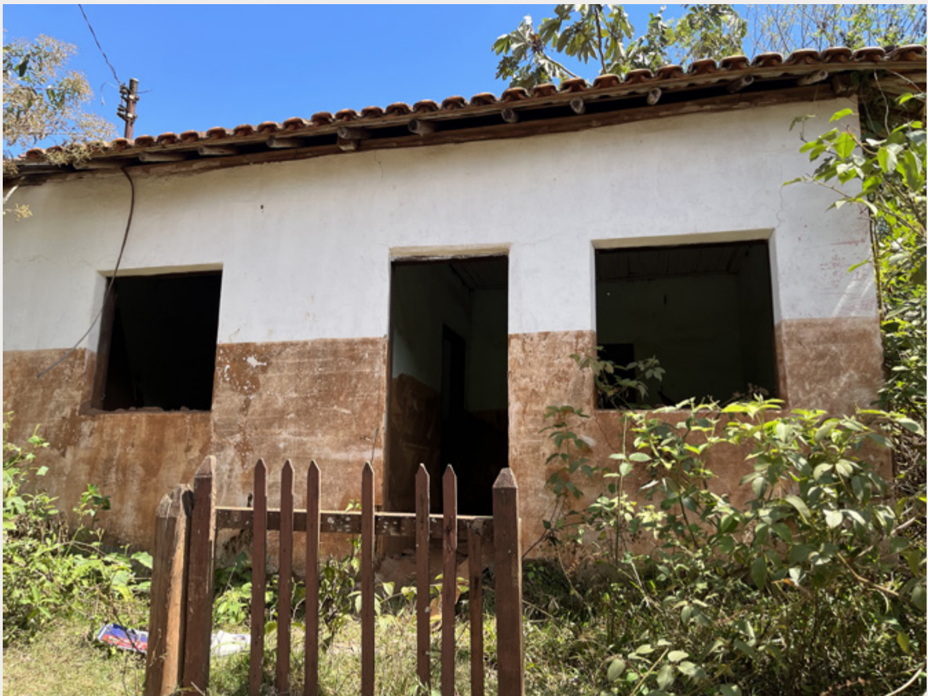
Mud line on a house hit by the Mariana tailings dam collapse, photo taken 27 August 2022

In an email to LAPFF, BHP has stated as follows: 'The quickest and fairest means for all those impacted to process and settle their claims is through the established and ongoing programs managed by the Renova Foundation, which is being supervised by the Brazilian courts. That system is working and paying. More than 410,000 people have received over R$13.5bn (over US$2.6bn) in compensation and financial assistance thus far. In terms of the impact on our provision - again their claims regarding our disclosures are highly misleading. We have appropriately included a contingent liability in respect of the UK action in our accounts for many years. Our position has not changed from what we disclosed at H1 results. [This information can be found] on pages 40-45 of the H1FY23 Results Announcement , and pages 140-144 (specifically 141) of the 2022 Annual Report , you will find commentary on contingent liabilities. Our contribution claim contends that if, contrary to BHP's defence, BHP is ordered to pay damages, Vale should contribute to any amount payable. This was a necessary procedural step given that Vale was not included as a defendant to the UK action.'