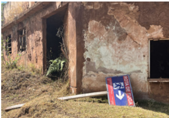
Fallen evacuation sign in Mariana, photo taken 27 August 2022