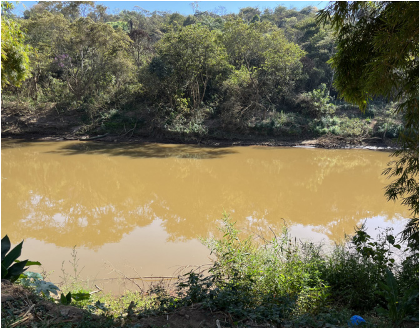
Muddy river at Brumadinho, photo taken 19 August 2022

The Federal Government of Brasil has stated that the biggest issue relating to the quality of water of the Rio Doce is untreated sewage, which is an historical problem.’