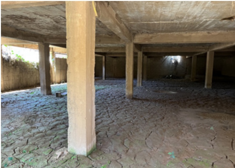
House floor covered in mud from river flooding, Brumadinho, photo taken 19 August 2022