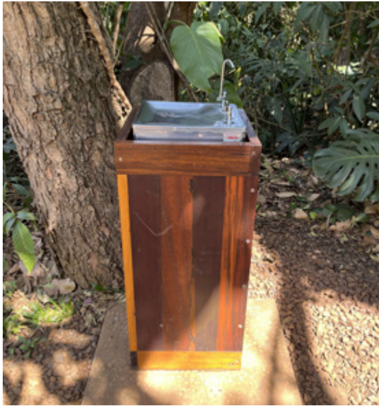
Drinking fountain at Inhotim museum in Brumadinho, photo taken 19 August 2022

with whom LAPFF spoke stated that their water had been contaminated by the Córrego do Feijão dam collapse in 2019. LAPFF was shown a very muddy river and was told that apart from being uncertain of its cleanliness for drinking and growing crops, the community members could no longer use the river as a recreational source. Vale disputed this claim, stating that the river had run with undrinkable water prior to the dam collapse.