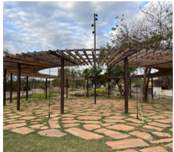
A park at Brumadinho funded by Vale, photo taken 30 August 2022

Vale is keen to point out that a legal settlement was reached in Brumadinho much more quickly than was the case in Mariana. 48 This is true. However, affected community members with whom LAPFF met still point to the inadequacy of the settlement and exclusion of a number of individuals from the agreement. Therefore, it is not clear at this stage whether there will be further legal agreements or litigation requiring Vale to pay more compensation for the damage caused. In any case, the company is having to undertake a significant number of community development projects that cost a lot of money in order to re-build its reputation in Brumadinho, including a community park, a food cooperative, and investment in the Inhotim museum to bring new industry to the city.