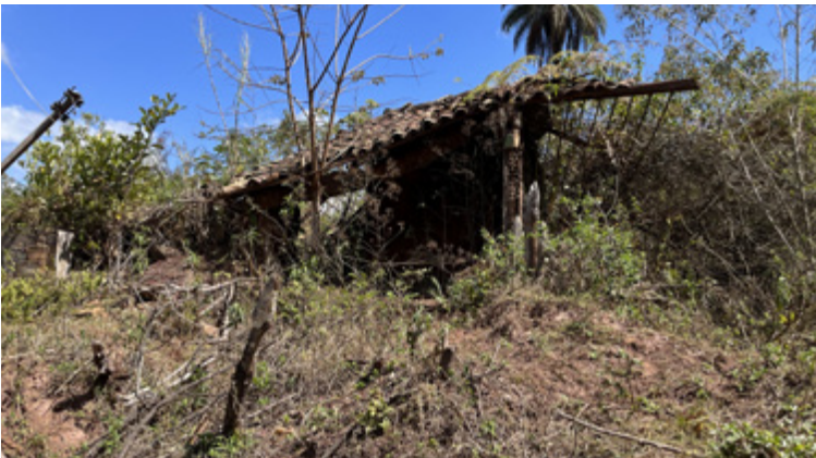
A house destroyed by mud in Mariana. As we descended the hill, the marks got higher and higher up the sides of the buildings until it was clear that the buildings had been covered by the mud, photo taken 27 August 2022