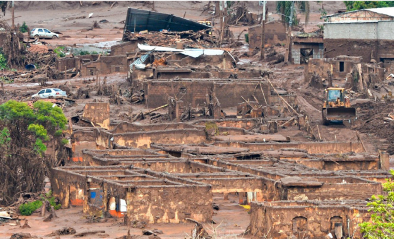
Mud covering the city of Mariana. November 7, 2015

gaps raised earlier. However, LAPFF is finding that both asset owners and asset managers are increasingly open to stakeholder input, including input from affected workers and communities, particularly as they better understand the financially material implications of this stakeholder input.