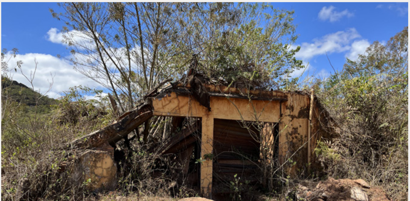
Structure destroyed by the Samarco tailings dam collapse, photo taken 27 August, 2022