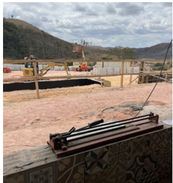
Paracatu resettlement with Vale and Renova, photo taken 29 August 2022 (nearly seven years after the Samarco tailings dam collapse)