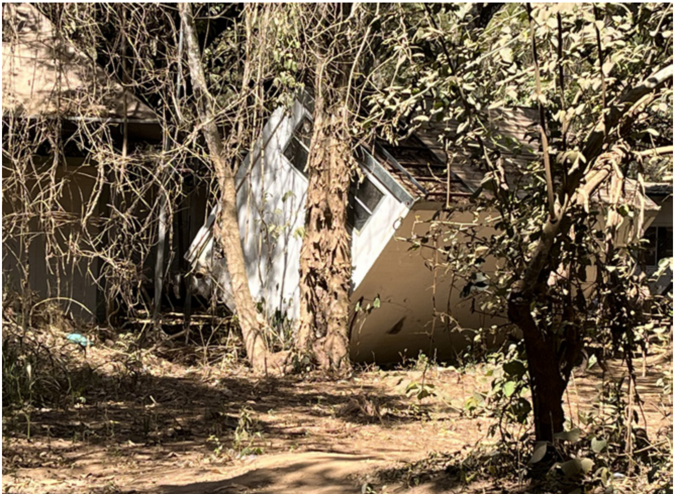
Building overturned by mud from the tailings dam collapse at Brumadinho, photo taken 18 August 2022