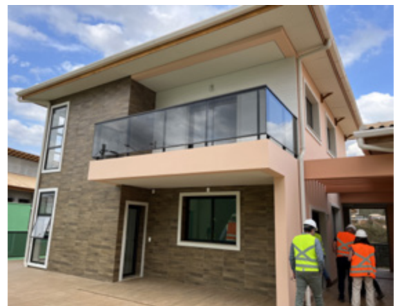
New house in Bento Rodrigues resettlement with Vale and Renova. “The only thing people have asked for in seven years is a house... the new houses are beautiful but non-functional.” photo taken 29 August 2022

One common complaint was that the new houses too often contained enclosed kitchens and