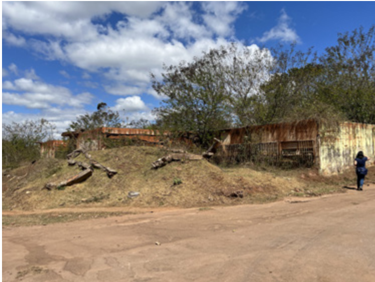
Mariana school covered in mud from the 2015 tailings dam collapse, photo taken 27 August 2022