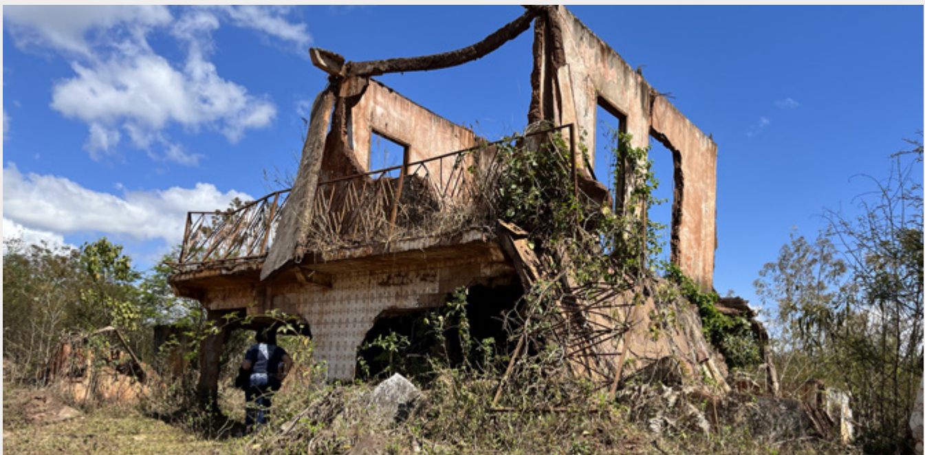
Structure destroyed by the Samarco tailings dam collapse, photo taken 27 August, 2022