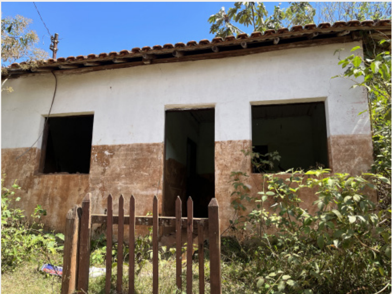
Mud line on a house hit by the Mariana tailings dam collapse, photo taken 27 August 2022

In an email to LAPFF, BHP has stated as follows: 'The quickest and fairest means for all those impacted to process and settle their claims is through the established and ongoing programs managed by the Renova Foundation, which is being supervised by the Brazilian courts. That system is working and paying. More than 410,000 people have received over R$13.5bn (over US$2.6bn) in compensation and financial assistance thus far. In terms of the impact on our provision - again their claims regarding our disclosures are highly misleading. We have appropriately included a contingent liability in respect of the UK action in our accounts for many years. Our position has not changed from what we disclosed at H1 results. [This information can be found] on pages 40-45 of the H1FY23 Results Announcement , and pages 140-144 (specifically 141) of the 2022 Annual Report , you will find commentary on contingent liabilities. Our contribution claim contends that if, contrary to BHP's defence, BHP is ordered to pay damages, Vale should contribute to any amount payable. This was a necessary procedural step given that Vale was not included as a defendant to the UK action.'