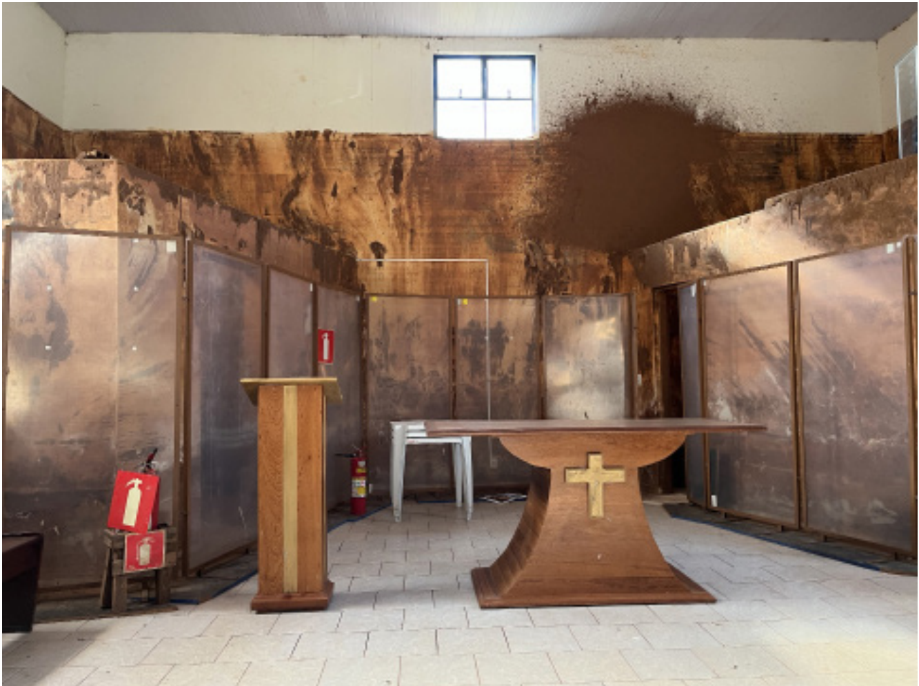
Mud line in church in Mariana, photo taken 25 August 2022

affected individuals needed – and are used to - open air kitchens to cook in their traditional manner. 33 In Brumadinho and Mariana, community members explained that the effect of the dam collapses on their water sources meant they could no longer use the water for the recreational purposes as they had used them previously. In Mariana, affected community members from Bento Rodrigues and Paracatu were extremely upset about the way in which the