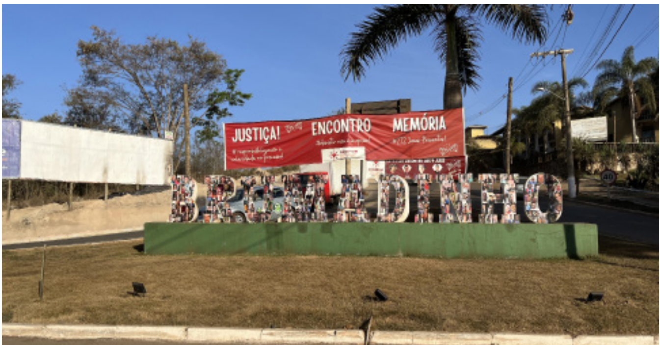
Sign at Brumadinho with the photos of all the people killed in the 2019 tailings dam collapse, photo taken 16 August 2022