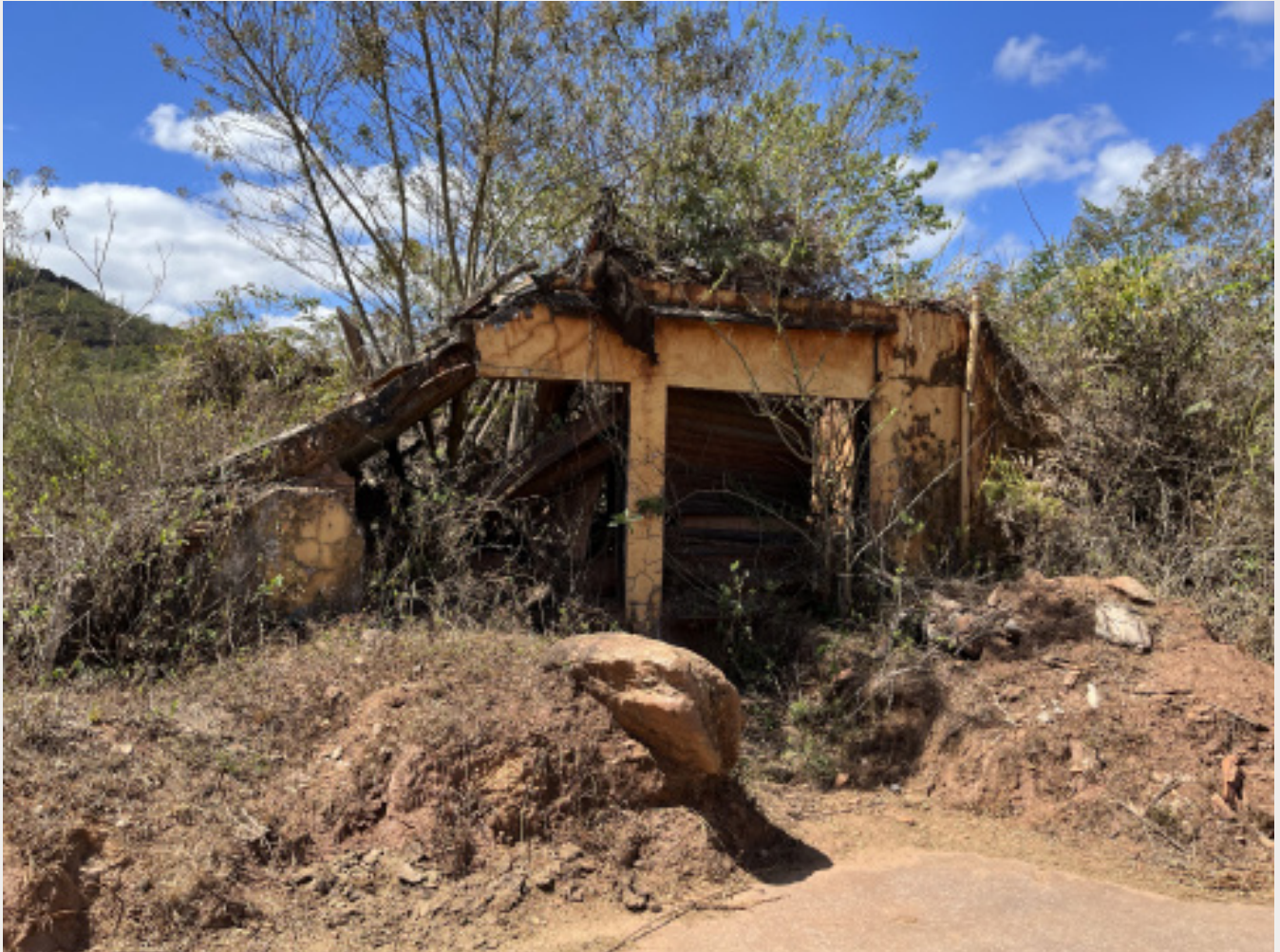
Structure destroyed by the Mariana tailings dam collapse, photo taken 27 August 2022

rights and environmental impacts in the three areas. In many of these situations, LAPFF has no external evidence to verify either the community or company views and has requested that independent assessments be conducted and disclosed so that LAPFF, and other investors, have a clearer factual basis on which to assess various allegations and defences.