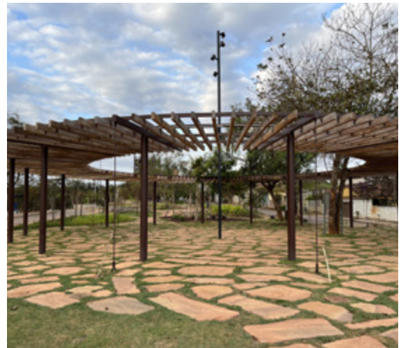
A park at Brumadinho funded by Vale, photo taken 30 August 2022

Vale is keen to point out that a legal settlement was reached in Brumadinho much more quickly than was the case in Mariana. 48 This is true. However, affected community members with whom LAPFF met still point to the inadequacy of the settlement and exclusion of a number of individuals from the agreement. Therefore, it is not clear at this stage whether there will be further legal agreements or litigation requiring Vale to pay more compensation for the damage caused. In any case, the company is having to undertake a significant number of community development projects that cost a lot of money in order to re-build its reputation in Brumadinho, including a community park, a food cooperative, and investment in the Inhotim museum to bring new industry to the city.