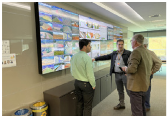
Vale's geomonitoring centre in Belo Horizonte, Minas Gerais, photo taken 30 August 2022

While these developments are positive, Vale has still acknowledged that the company has two high risk tailings dams in Brazil. Although the dams are being decharacterised, they could still rupture at any time. LAPFF heard from community representatives that at least one of these dams is three times the size of the Córrego do Feijão dam at Brumadinho and could cause significantly more damage than either