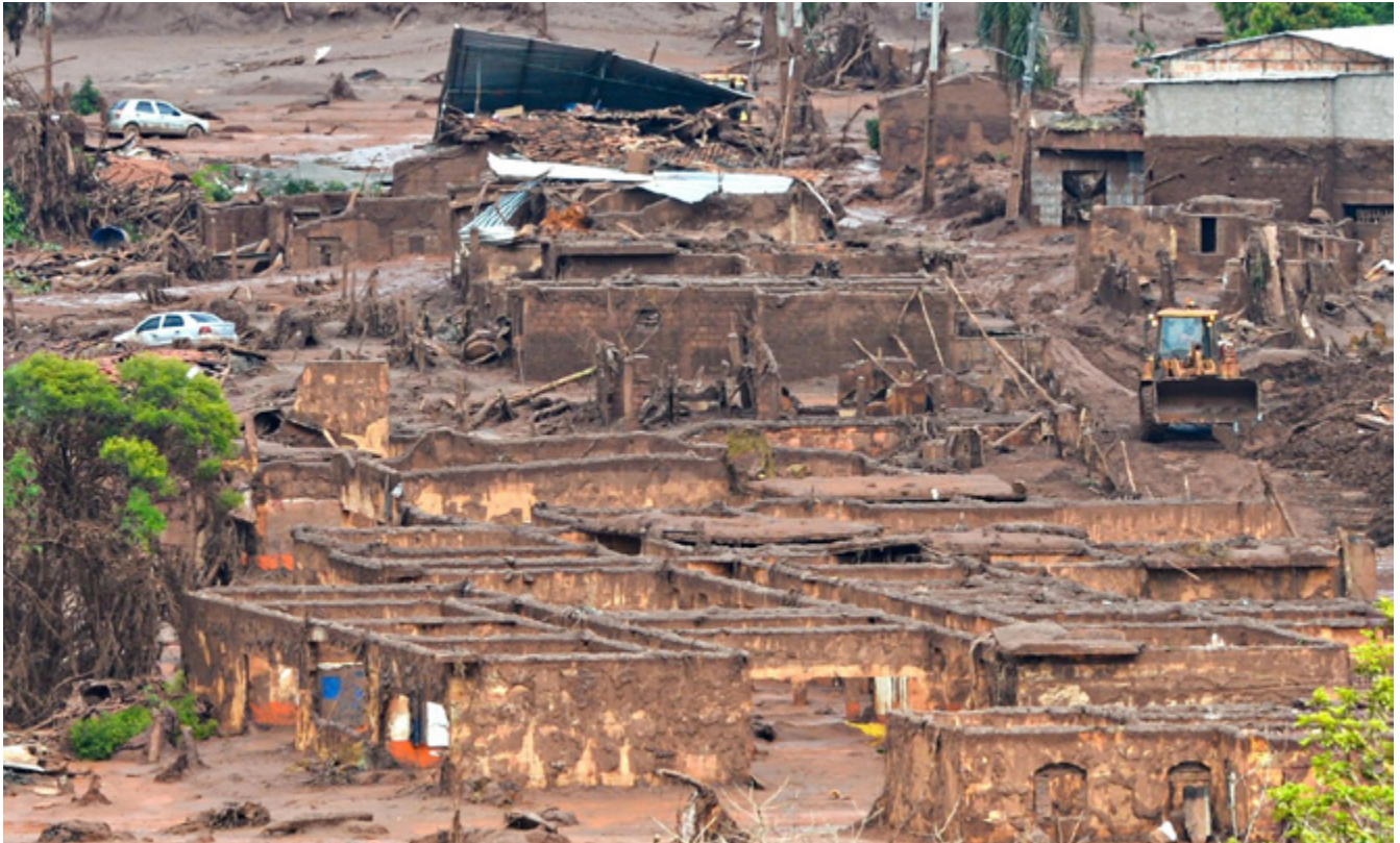
Mud covering the city of Mariana. November 7, 2015

gaps raised earlier. However, LAPFF is finding that both asset owners and asset managers are increasingly open to stakeholder input, including input from affected workers and communities, particularly as they better understand the financially material implications of this stakeholder input.